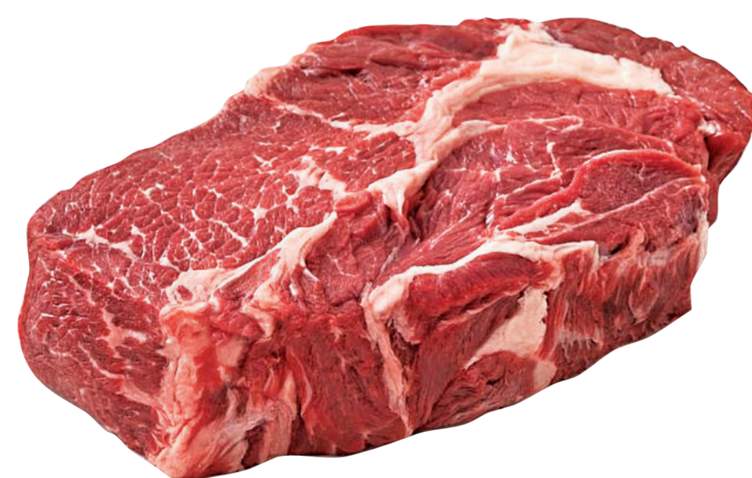
Brandt Beef Fresh Natural Chuck Roast