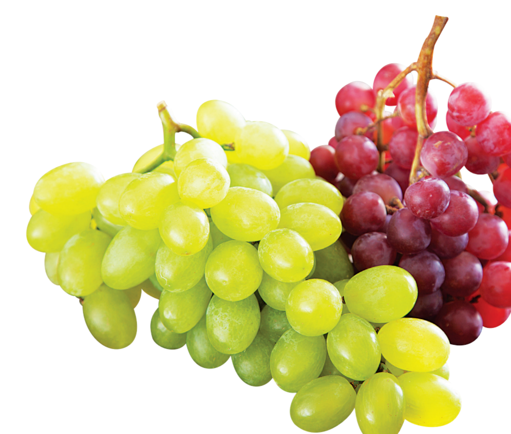
Sweet Green & Red Grapes Grown in Mexico