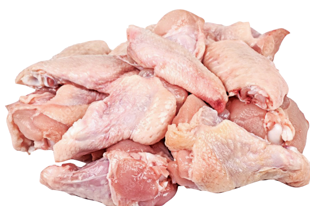
Mary's Air-Chilled Fresh Free Range Chicen Party Wings