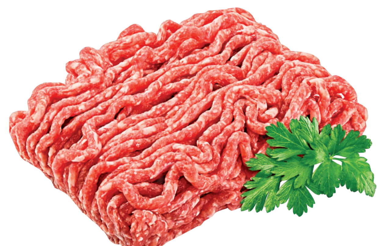
Brandt Beef Fresh Natural Ground Chuck (Ground In-House Daily)