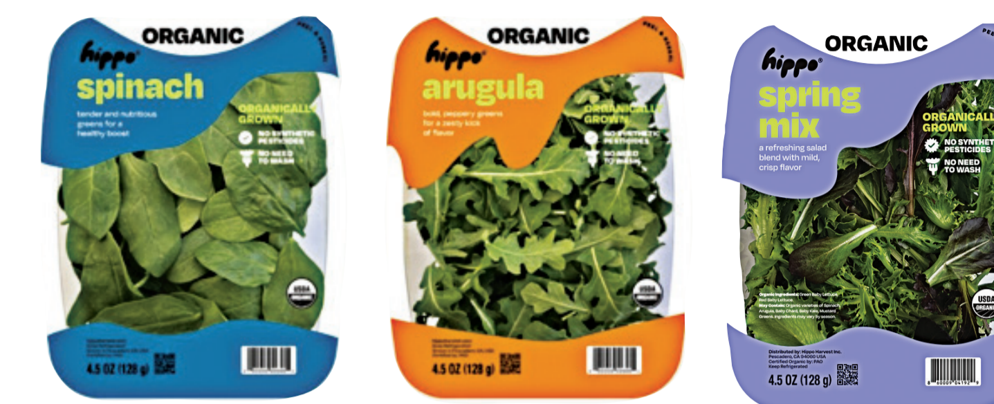
Organic Hippo Salads Grown in USA • 4.5 oz