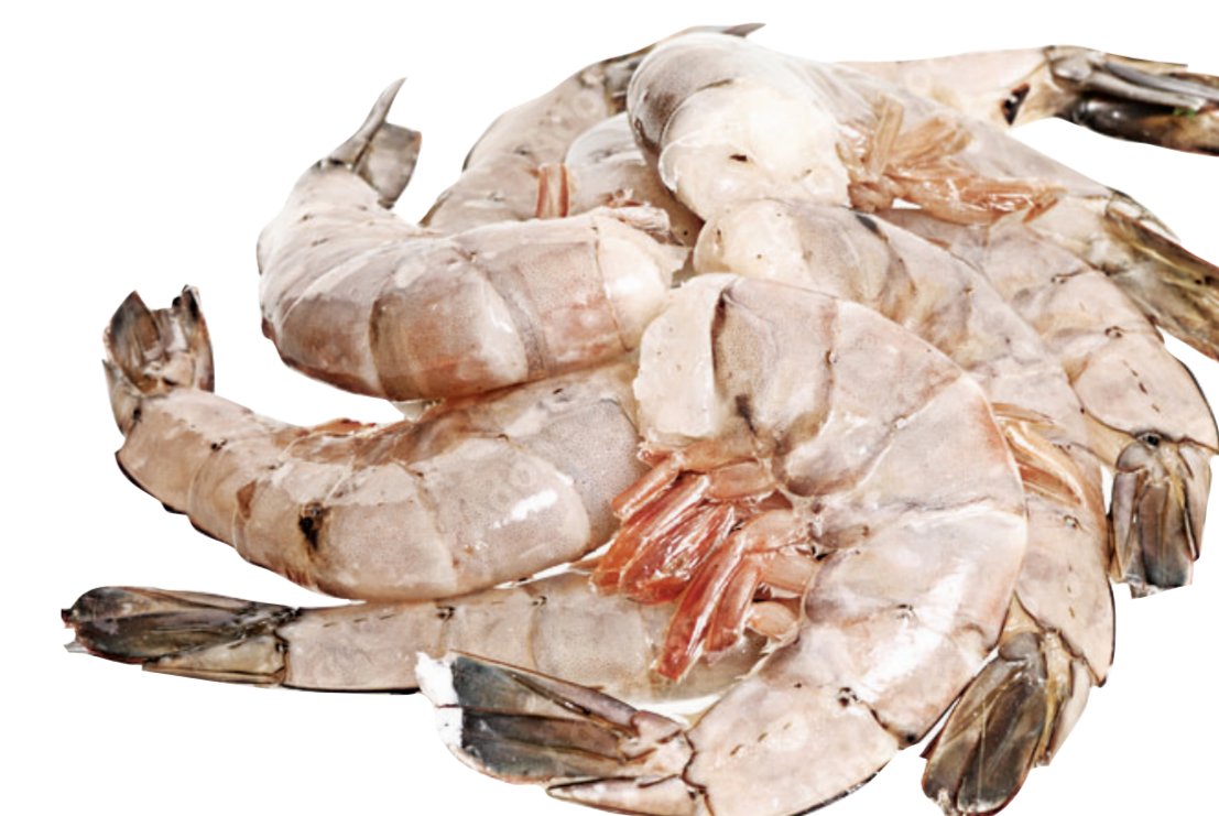
Wild Caught 21/25 Gulf Prawns (Raw, Shell On, Previously Frozen)