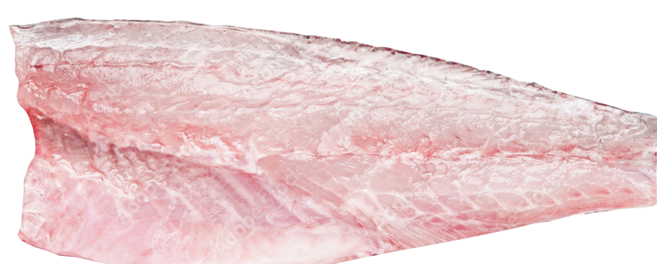
Wild Caught Corvina Seabass Fillet (Previously Frozen)