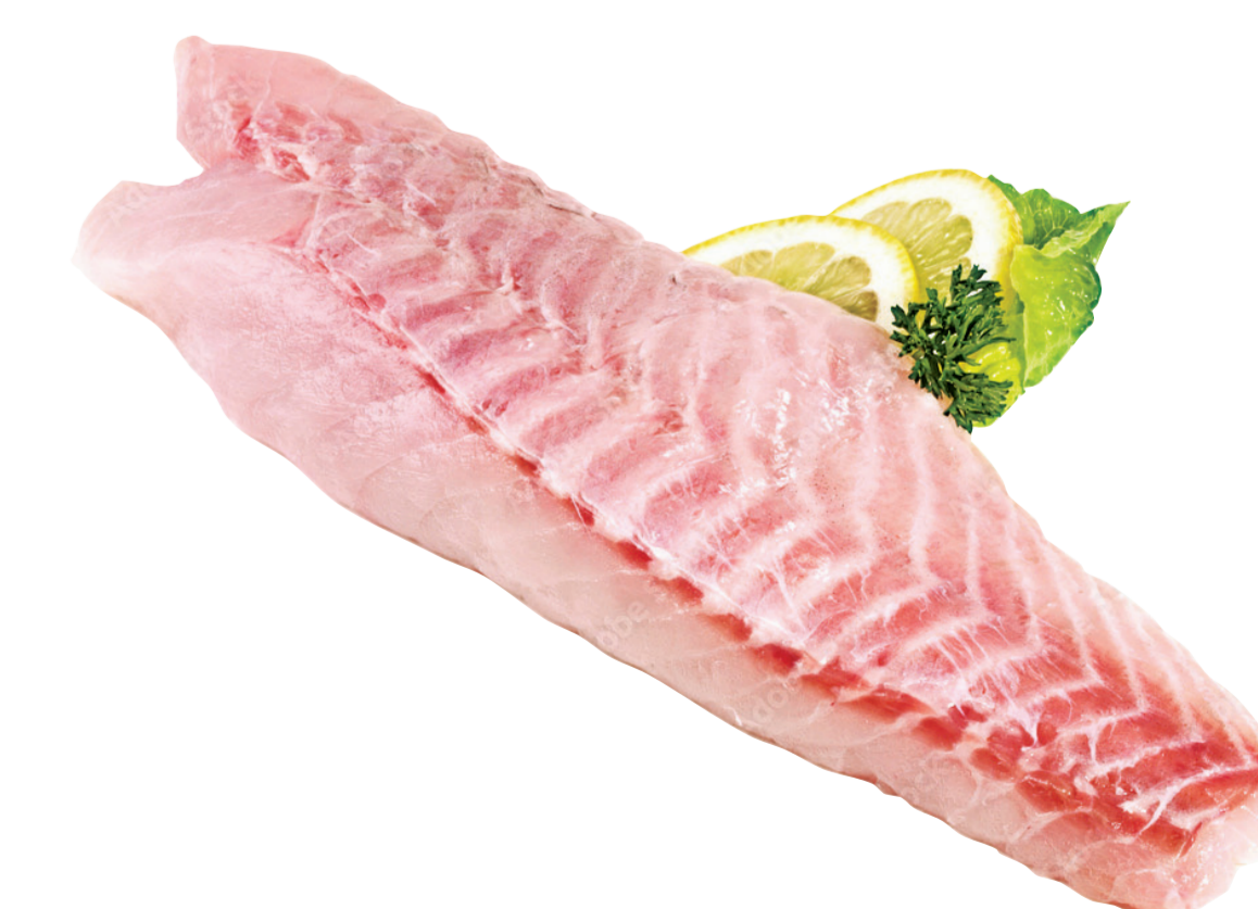
Fresh Wild Caught Local Ling Cod Fillet