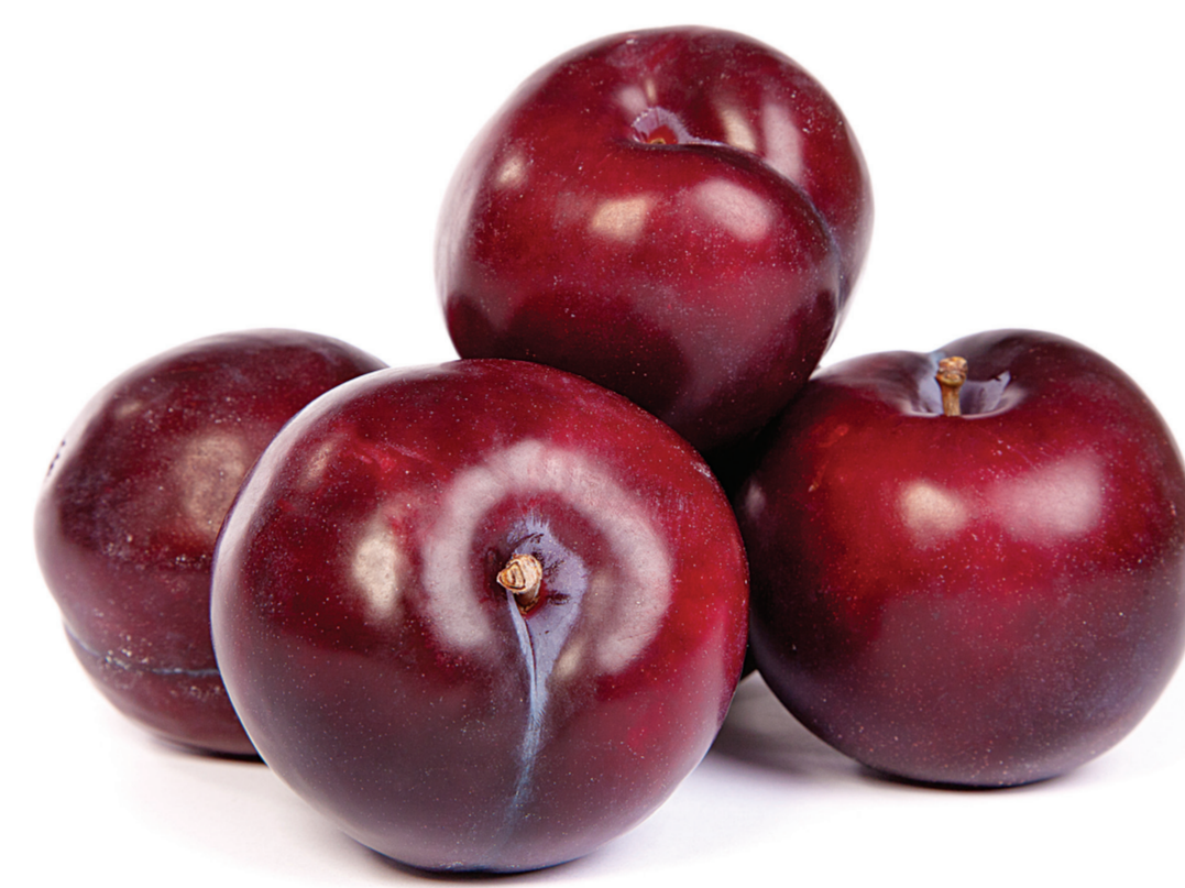
Organic Crimson Punch Plums Grown in California