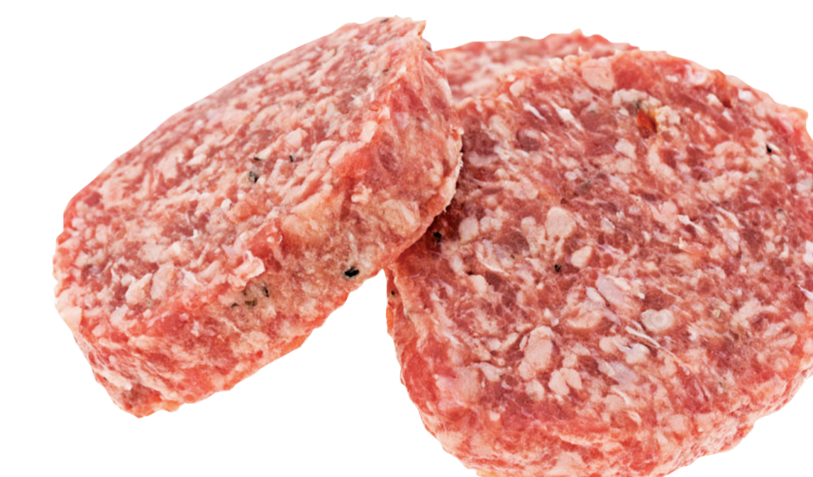
House-Made Fresh Bulk Country Pork Sausage