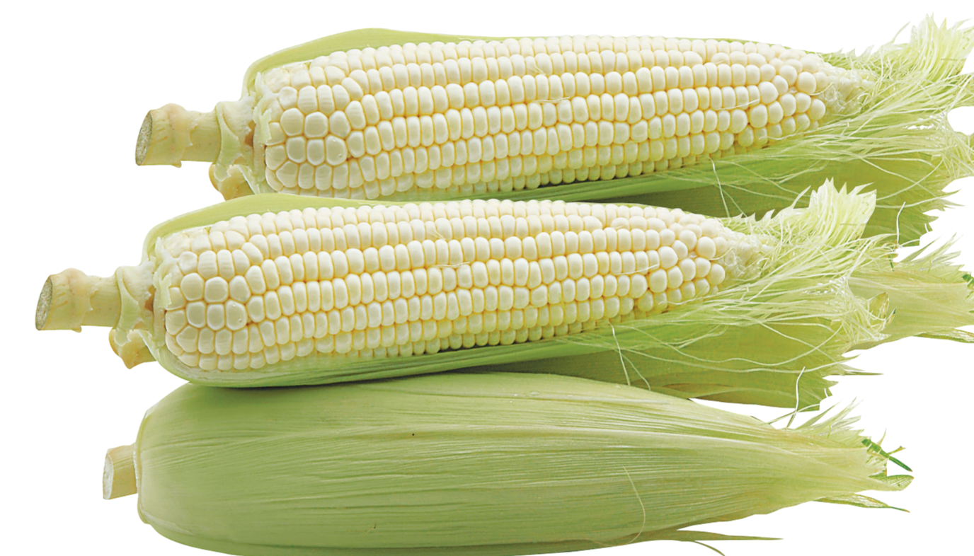
Sweet White Corn Grown in California