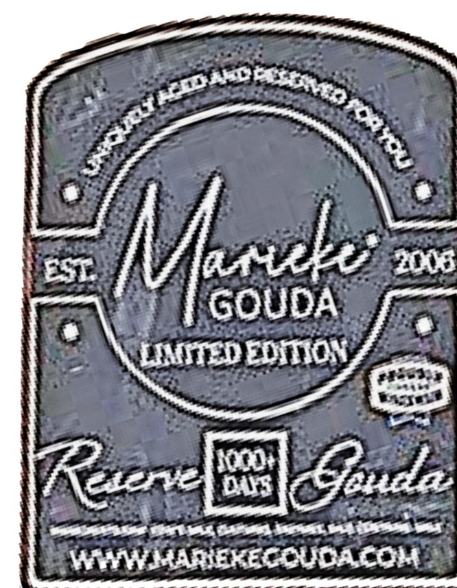
Marieka 1000 Day Old Gouda