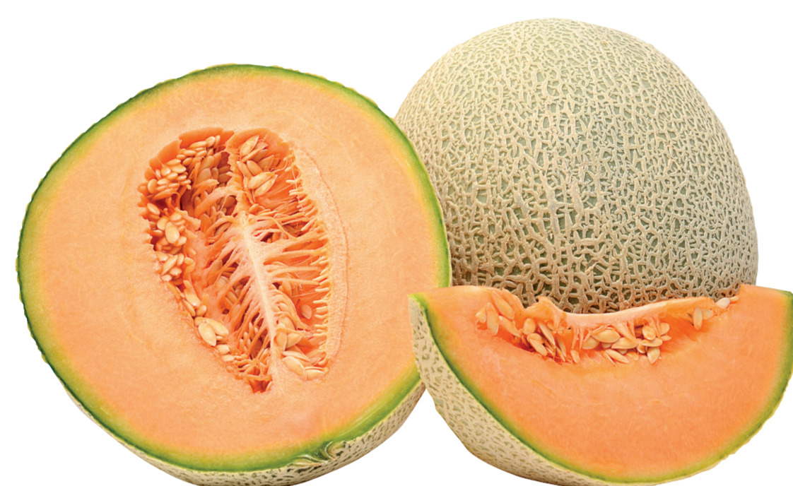
Large Cantaloupes Grown in California