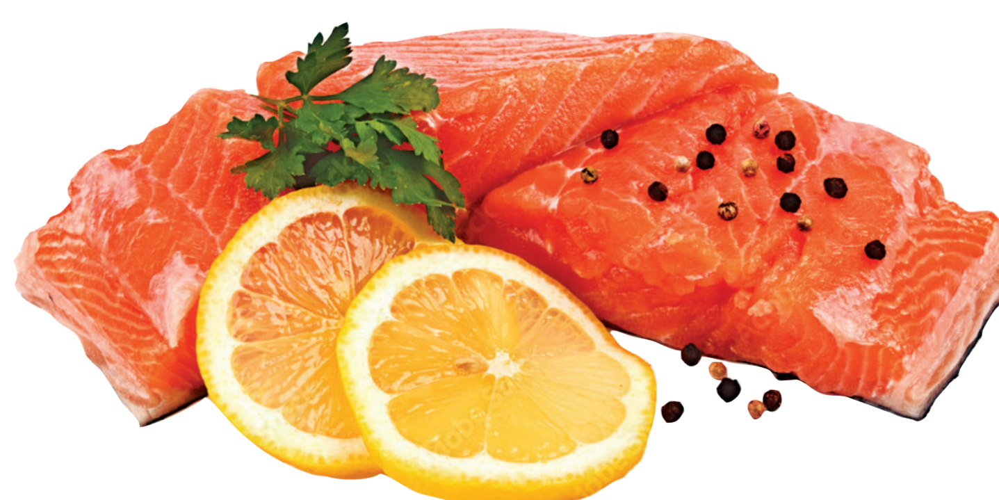
Fresh Wild Caught Local King Salmon Fillet