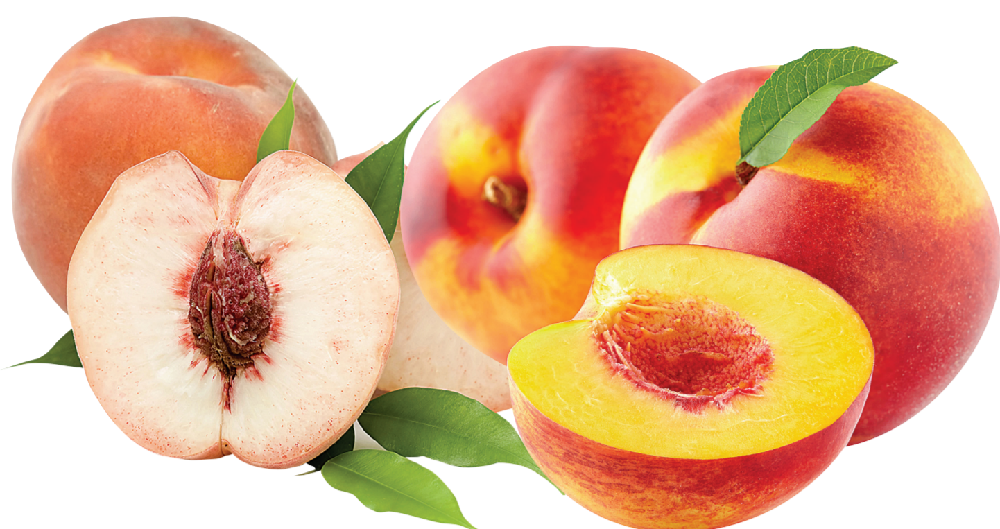
Peaches And Nectarines Grown in California