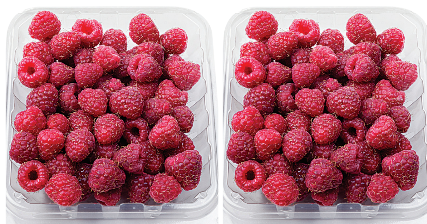
Organic Raspberries 6 oz • Grown in Mexico