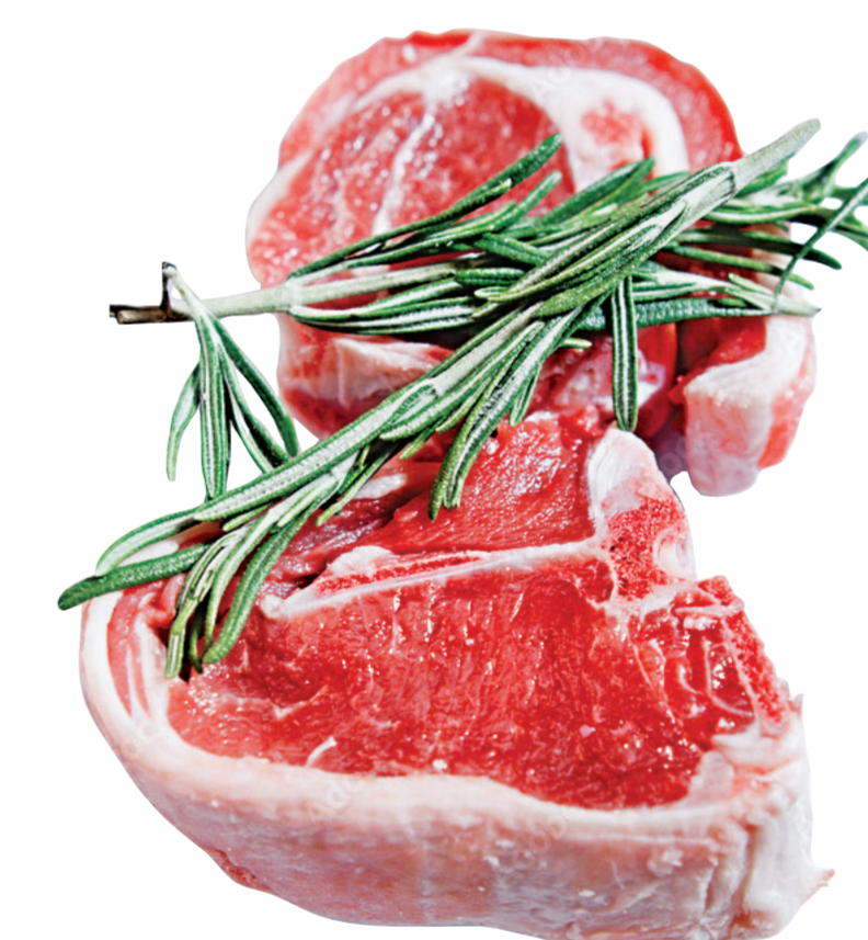
Niman Ranch Fresh Natural Lamb Loin Chops