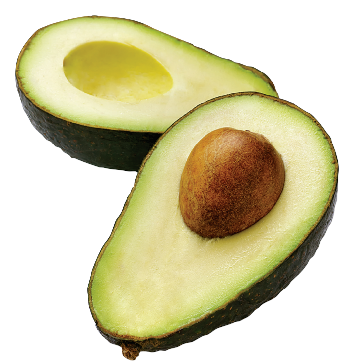
Organic Large Hass Avocados Grown in California

(44th and Noriega) 3701 Noriega St. (415) 564-0370 7 am - 9 pm